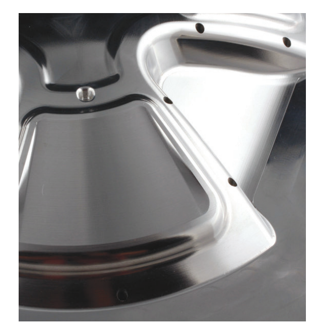
The proof of any CAM software is what comes off the machine. Mastercam is crafted to help you get the best possible finish in the shortest amount of time.

Dynamic Motion powers much of our 2D solutions. It allows you to maximize your material removal rate and can lower your cycle time, while increasing the life of your cutting tools. Check out Mastercam.com/dynamic to learn more.