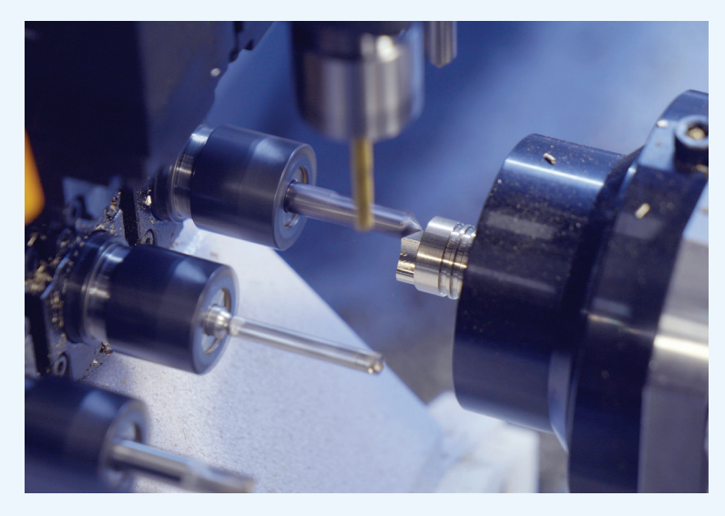
Machine-specific options within Mastercam ensure you have precise control and solid code.