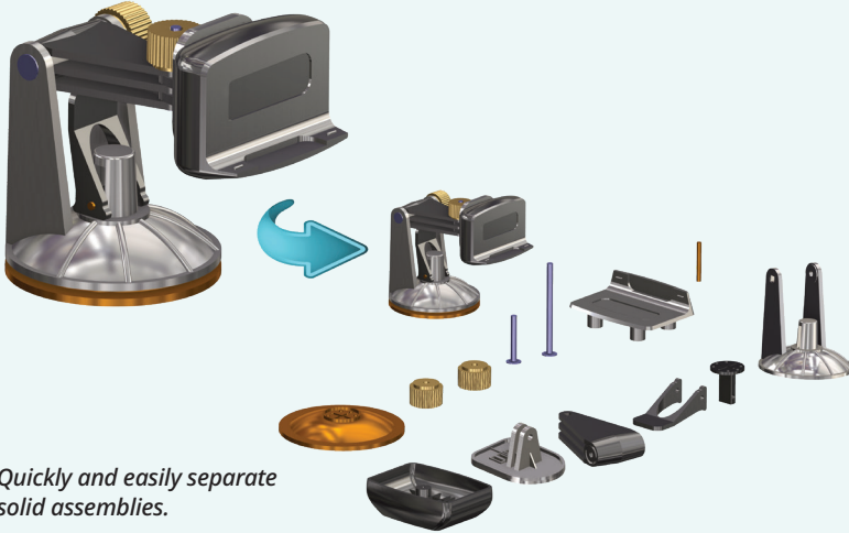
Quickly and easily separate solid assemblies.

Whether you're bringing in a file from an outside CAD package or designing one yourself, Mastercam's powerful, easy-to-use CAD engine gives you control over the final details of even the most complex jobs.